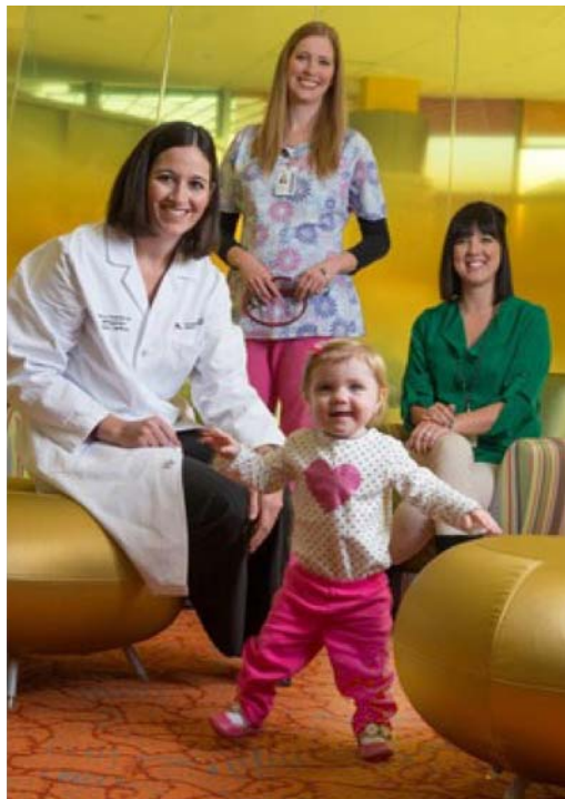
A young patient at Masonic Children's Hospital surrounded by her care team

If you are unable to deliver gifts during those times but still wish to