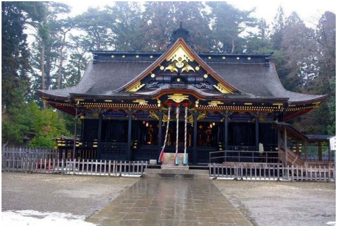
Osaki Hachimangu Shrine